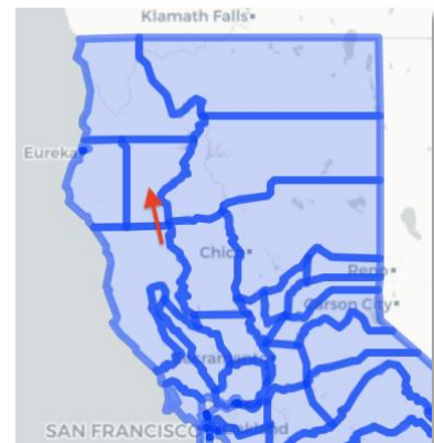
Trinity Boundary 1853